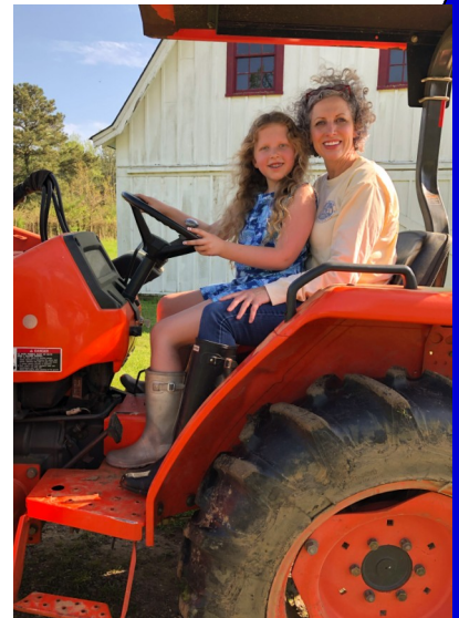
(Right) "Laurel in Laurel" with kiddoes